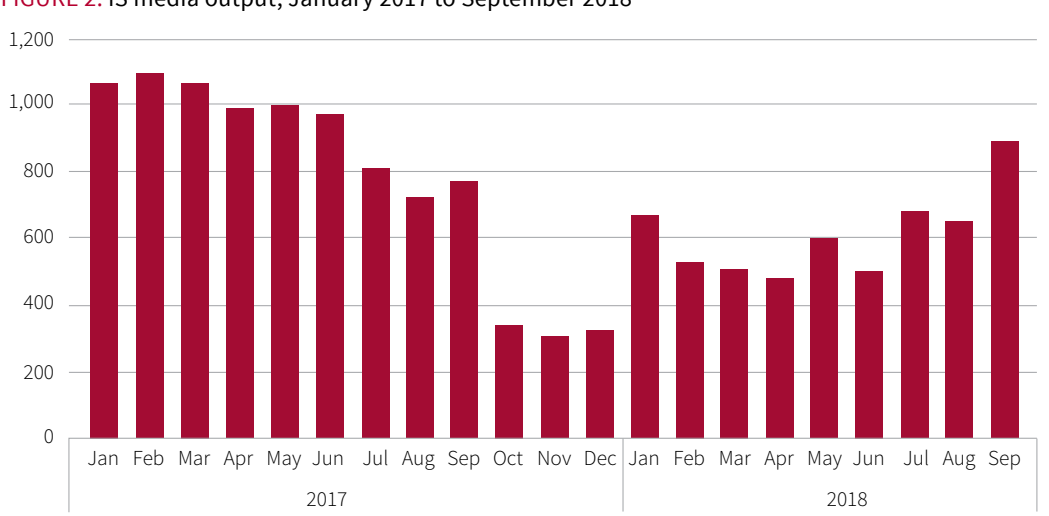
FIGURE 2: IS media output, January 2017 to September 2018

IS's use of social media for marketing and communication has been credited not only with 'socialising terror' 19 through public opinion as previous terrorist groups did, but also with making terror popular, desirable and imitable.<sup>20</sup> At its peak, IS controlled more than 46,000 Twitter accounts, which it used to spread its messages directly to the smartphones of its audiences, avoiding the mediation of gatekeepers in traditional media.<sup>21</sup> While data from the BBC suggests a steady decline in IS's media output from November 2016 to November 2017—since the fall of Raqqa in October 2017, IS's daily media output decreased from 29 to just 10 items per day<sup>22</sup>—that decrease shouldn't be mistaken for a decline in the group's ability to influence disaffected people globally to act on its behalf. The most recent data from the BBC (Figure 2) indicates that the group maintains a robust online presence and has taken to using