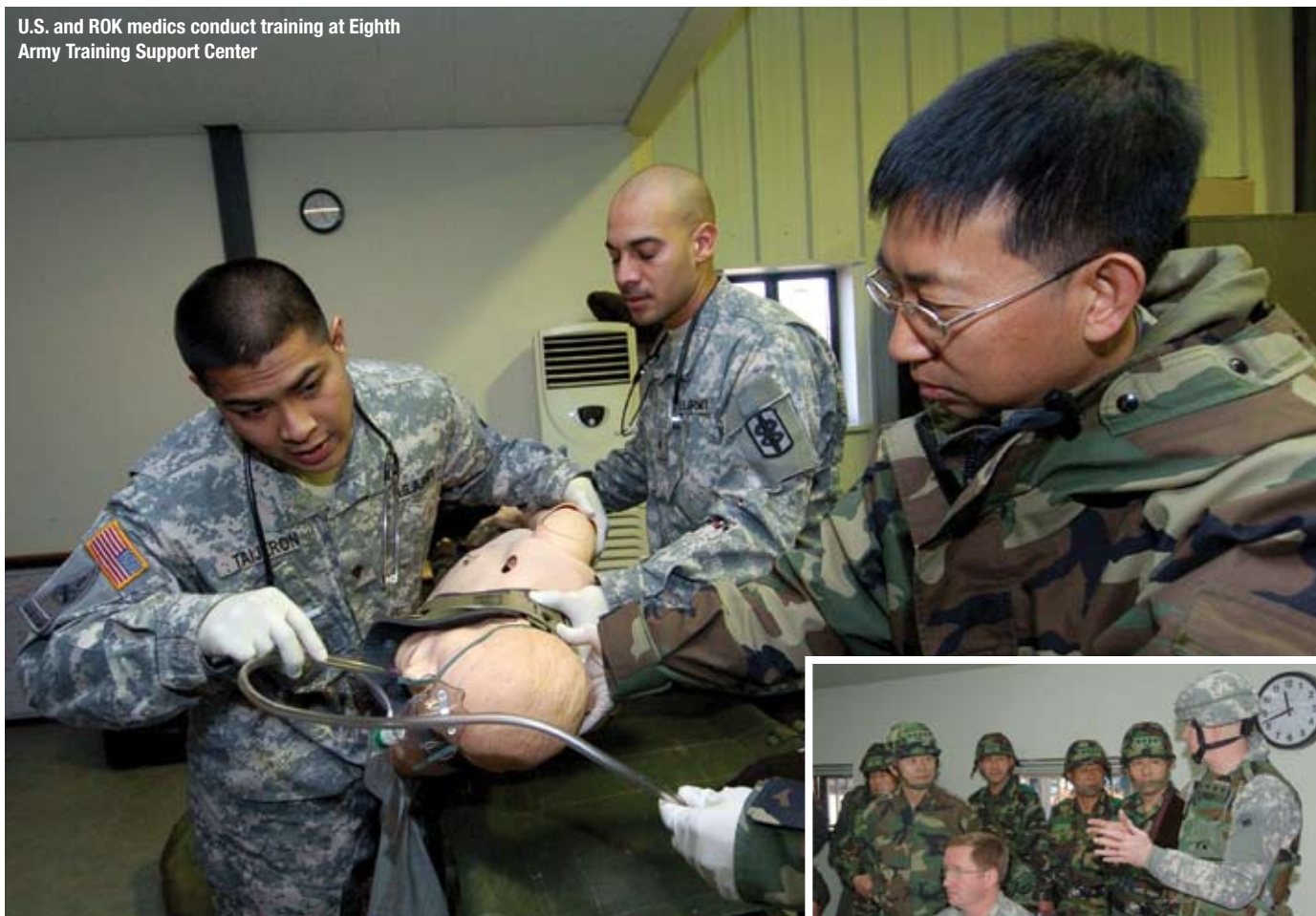
U.S. and ROK medics conduct training at Eighth Army Training Support Center