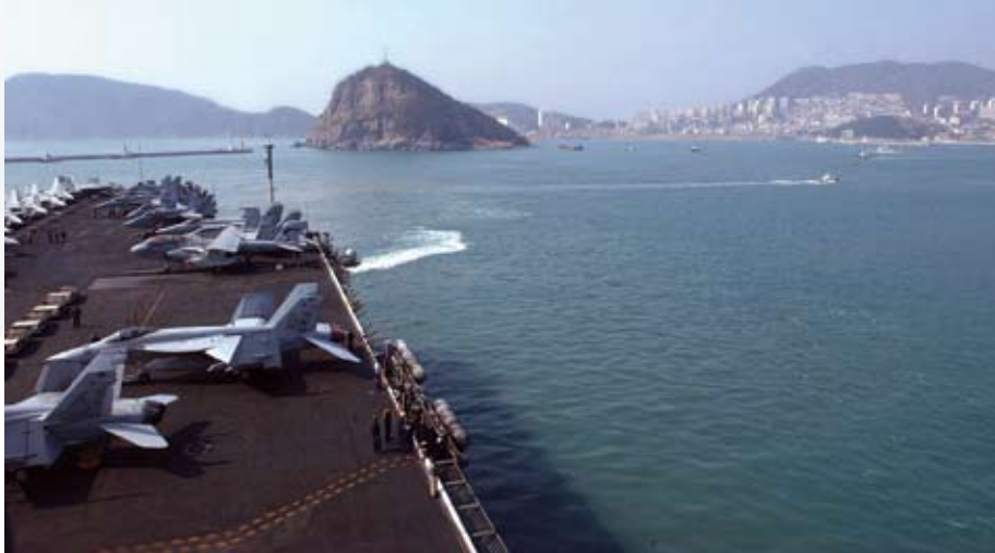
USS Ronald Reagan pulls into Pusan, South Korea, in support of Reception, Staging, Onward Movement, Integration theater exercise

The United States and Republic of Korea established CFC on November 7,