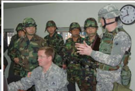
GEN Bell discusses Army Prepositioned Stock support with senior ROK military leaders

Upon its founding in 1948 and continuing even after the 1953 armistice agreement, the Republic of Korea has endured repeated cycles of intense North Korean unconventional warfare. Intent on subverting the governing ability of the democratic south and weakening the resolve of the ROK-U.S. alliance, North Korea employed agitation, propaganda, and terrorist acts, including assassinations of ROK civilians and government officials, as well as sporadic combat against ROK and U.S. forces. In the face of these threats, the alliance remained resolute in its defense of freedom. Serving alongside U.S. forces during the Vietnam War, the Persian Gulf War, Operation Enduring Freedom , Operation Iraqi Freedom , and on the Korean Peninsula, the ROK military has demonstrated superb competencies as well as a firm commitment to the international community.