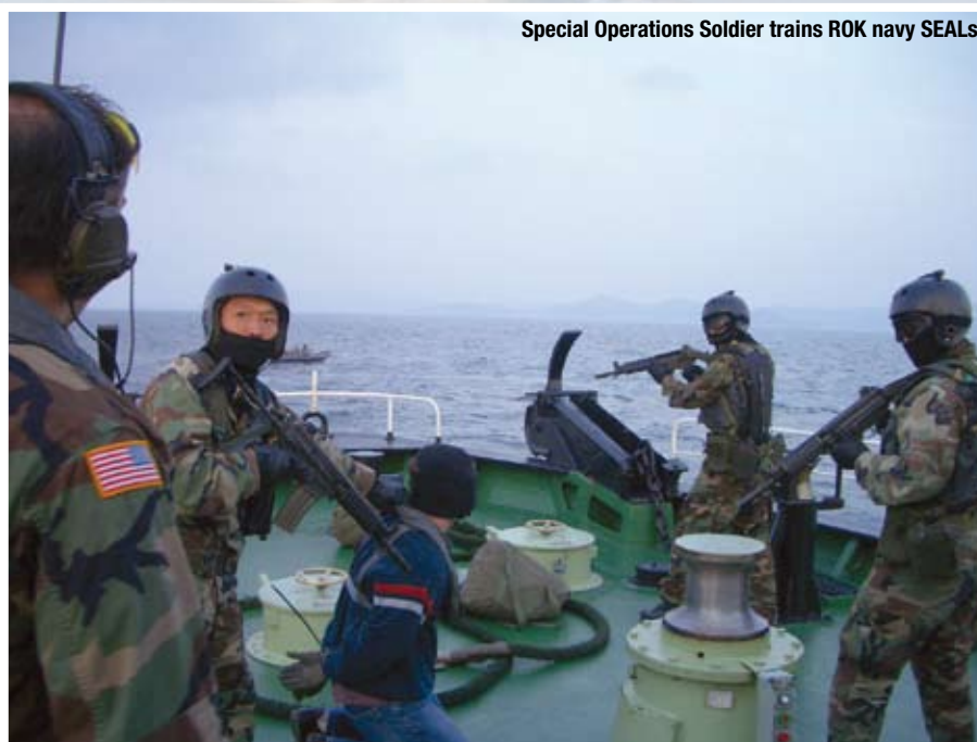
Special Operations Soldier trains ROK navy SEALs

As with any multinational force, unity of effort in achieving agreed effects in the theater and without diminishing freedom of action is critical. To ensure unity of effort, the United States and ROK will establish coordinating centers, cells, boards, and liaison teams at all echelons for effective and continuous communication and planning. UNC/CFC/USFK has over 30 years of lessons learned to inform planning efforts. Since the mid-1970s, combat support coordination teams have served as coordination links between UNC/CFC/USFK and major